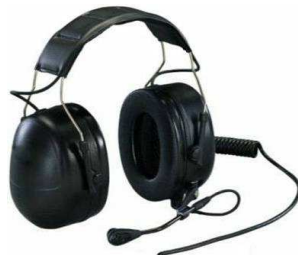
UHSP-7 OPTIONAL HEADSET

Weatherproof box (IP-66) with active telephone circuitry, headset connection socket and full keypad (DTMF only). To be connected directly to analogue telephone line as a stand-alone station or in a combination with standard telephone. Recommended for noisy machinery areas etc. To be used with optional UHSP-7 headset.