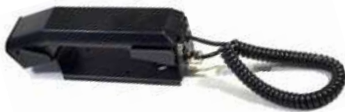
OPTIONAL WATER-TIGHT HANDSET