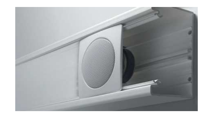
Cable channel instalation